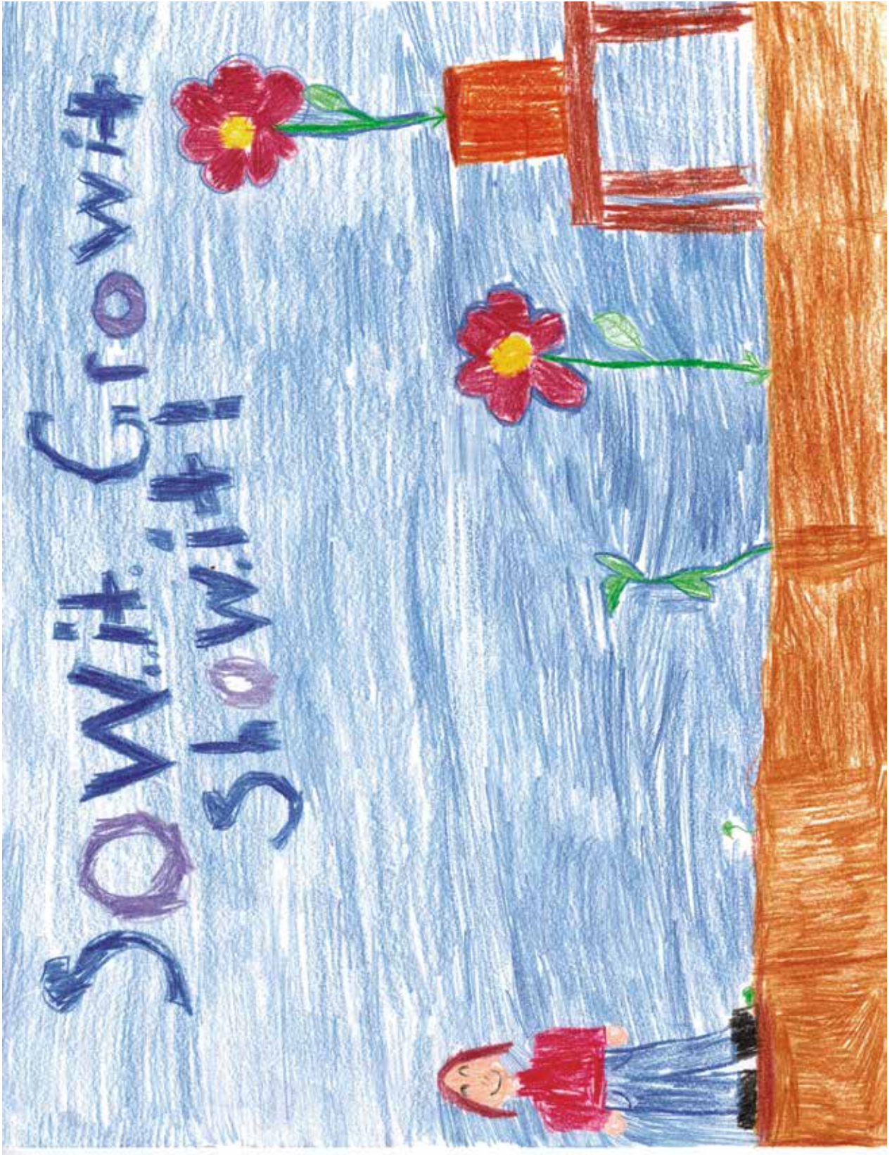
Adrianna Daigle Grade 5 - Homeschooled