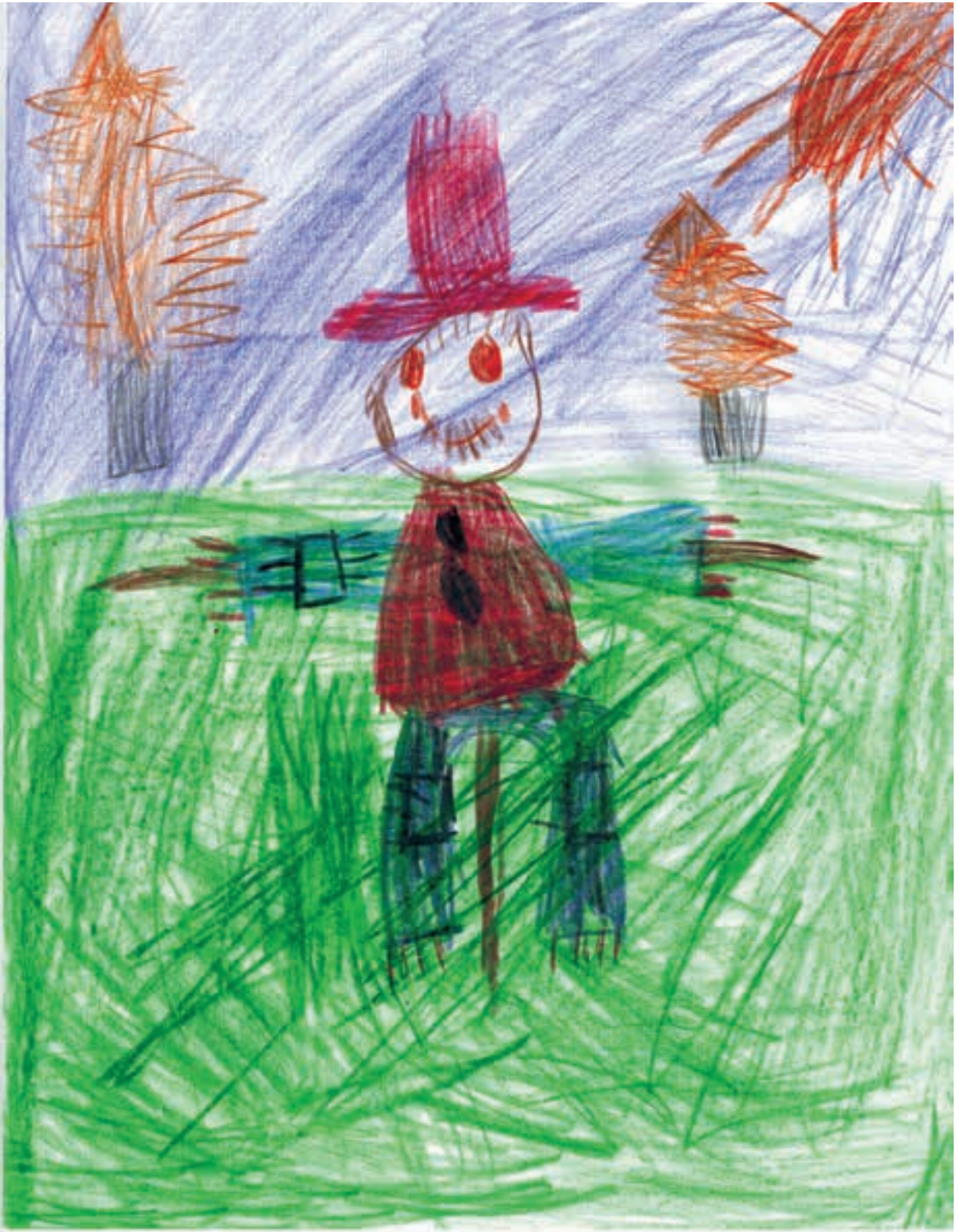
Aurora Dusolt Grade 3